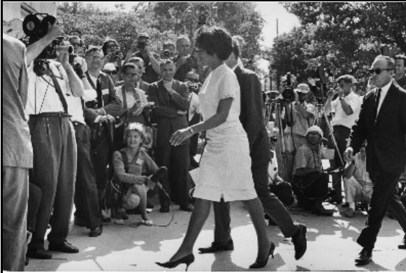
Vivian Malone and James Hood walk through the crowds as they become the first Black students to enroll at the University of Alabama in Tuscaloosa, Alabama, on June 11, 1963.