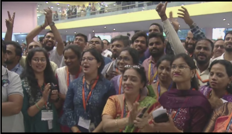
Members of the Chandrayaan-3 ISRO team celebrating the successful soft landing of the spacecraft on the Moon

In 2009, India's Chandrayaan-1 mission, the country's first lunar mission, detected water on the Moon concentrated at its poles. On Wednesday 23rd August 2023, India made history by becoming the first country to successfully land a spacecraft in the South Pole region of the Moon, as Chandrayaan-3's lander Vikram touched down.[...] India becomes only the 5 fourth country to soft land a spacecraft on the Moon, a remarkable achievement for humanity.